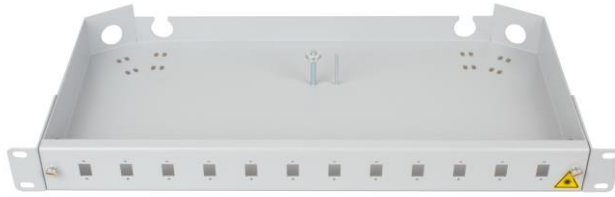
ZMPJ-1 The cabinet without adapters