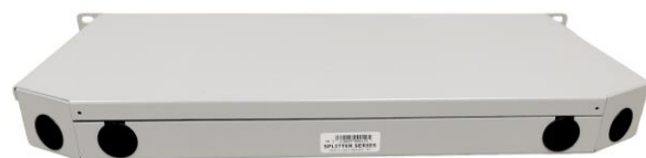
Back view of ZMPJ-1