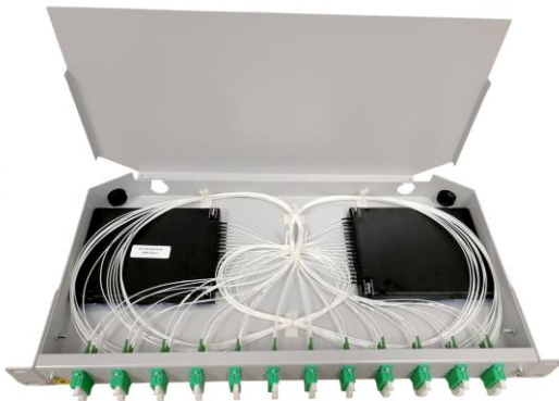
Equipped ZMPJ-1 cabinet