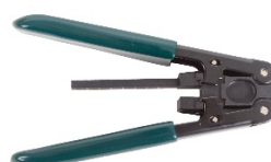
Drop Cable Stripper