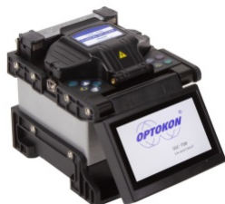
OSC-700 Fusion Splicer