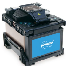
OSC-700 Fusion Splicer