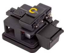
OCL-100 Fiber Cleaver