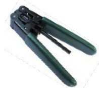
Drop Cable Stripper