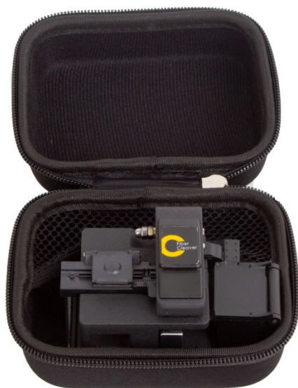
OCL-100 cleaver in soft case